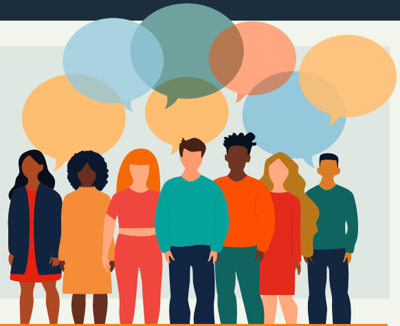
Montana High School Students Feeling Sad or Hopeless (2013-2023)

When young people most affected by these challenges are trusted to help lead solutions, programs better reflect real needs, strengthen belonging, and improve mental health.